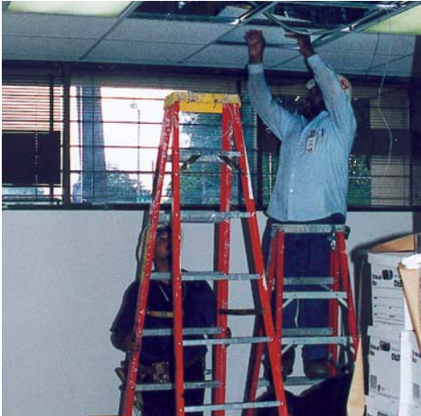
Flood repair at the Stehlin Foundation

Starting Thursday, June 7, and continuing throughout the weekend, Tropical Storm Allison deluged the Houston area with over 33" of rain. The city's storm drains and sewers were overwhelmed, homes and offices were submerged, and 22 people perished. Houston's "Texas Medical Center" was incapacitated for weeks, and many hospitals reported the tragic loss of decades of research data.